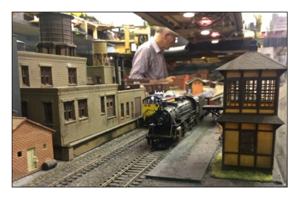
"The Treasurer's new toy, USRA light Mikado in the Richmond yard".