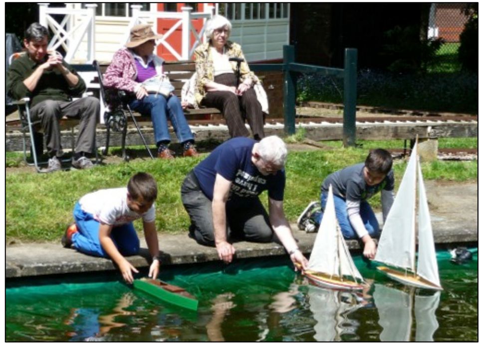
Toy Boat full family fun

Few regulars now turning up on Sunday afternoons, great atmosphere. Come along and join us all even just to sit and natter.