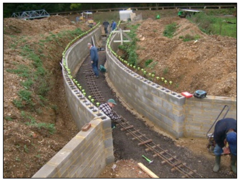
Side walls built